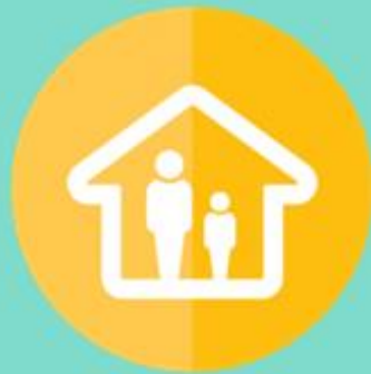
Stay Home If You Are Sick