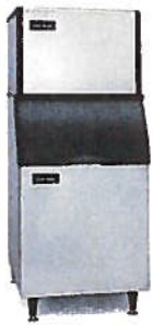
*Air-cooled Ice Machine