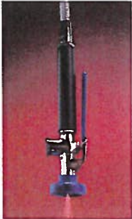
*Pre-Rinse Spray Valve

Save water, energy and money with the CASH FOR KITCHENS program.