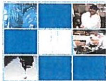
CASH FOR KITCHENS Water Efficiency Program Cash for Kitchens Survey Report