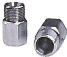
*Faucet Flow Restrictor