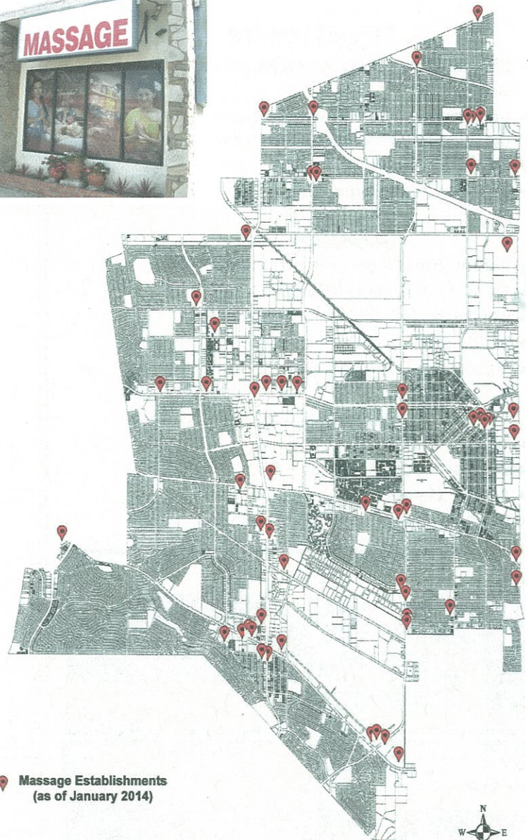
Message Establishments (as of January 2014)